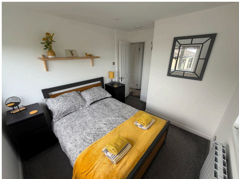
The Bungalow 21 Landscope Holiday Village