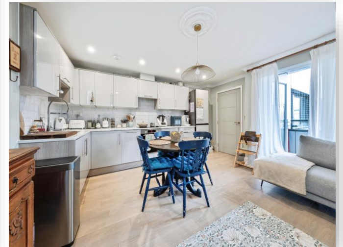
Silbury Boulevard, Milton Keynes, MK9 1LT