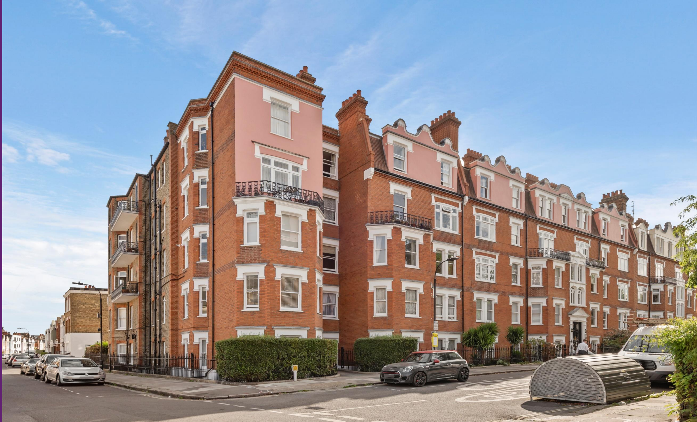
Waldemar Avenue Mansions Waldemar Avenue, SW6