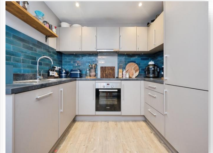
Azera, Capstan Road, Southampton SO19 9UR