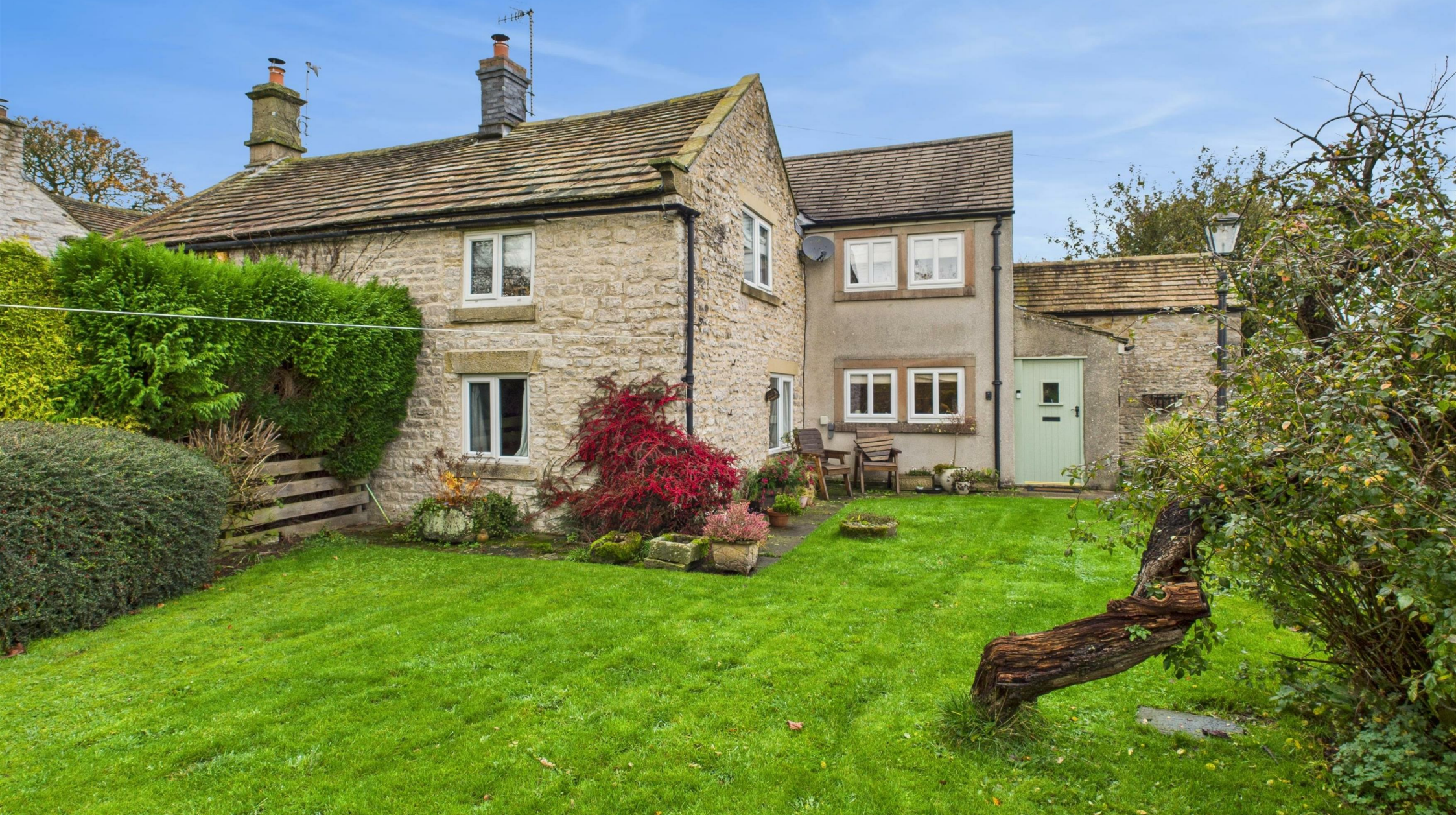
Holly Cottage Bradshaw Lane, Foolow, Eyam, Hope Valley S32 5QR