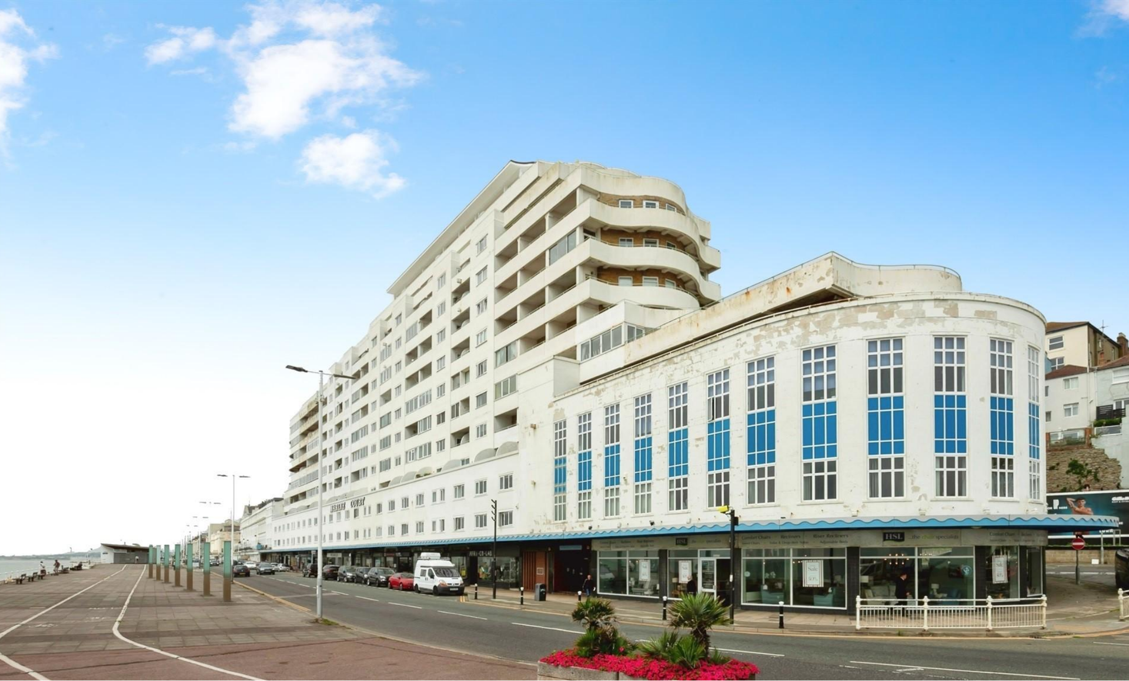
Marine Court, St. Leonards-On-Sea TN38 0DW