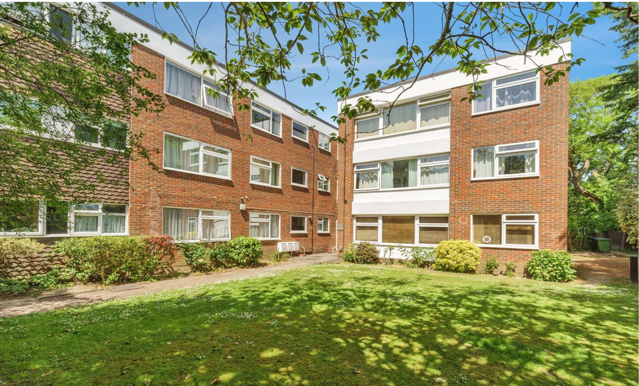
St Andrews Gardens, Worthing BN13 1ES