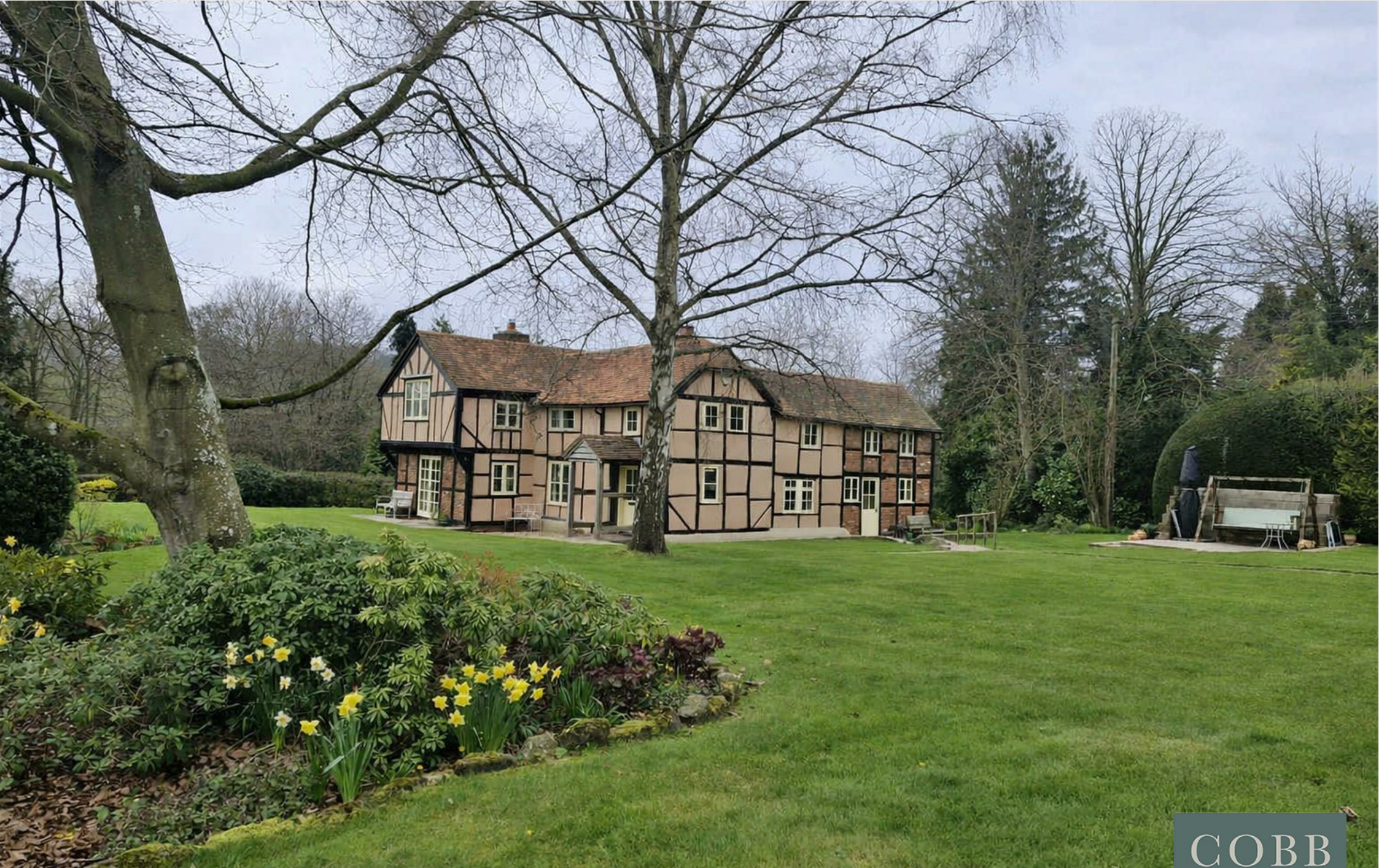
Westmoor Cottage, Mansel Lacy, Hereford, HR4 7HN Price £865,000