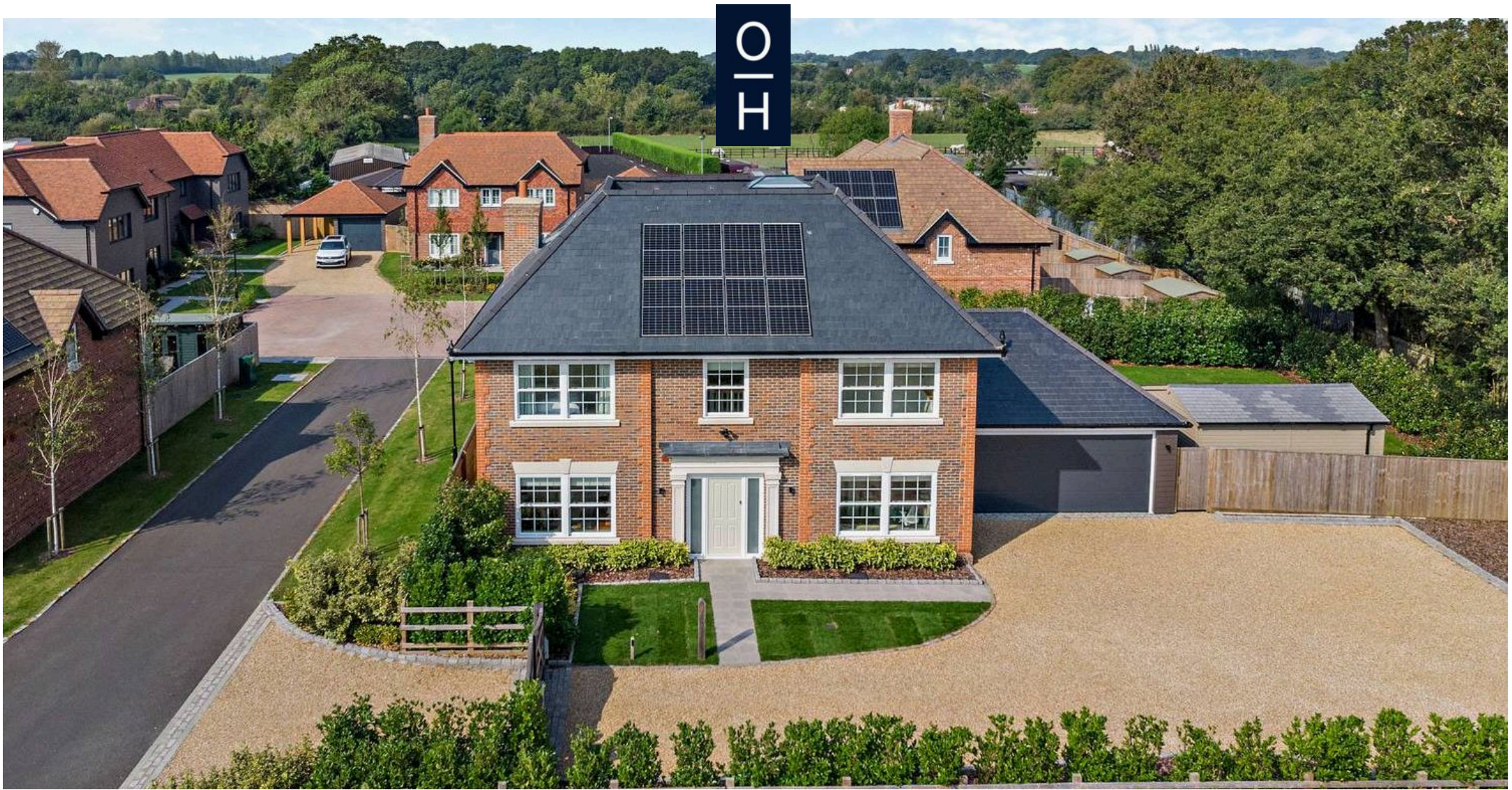
Moat Farm Close Winkfield