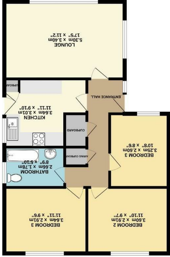
GROUND FLOOR 70.7 sq.m. (761 sq.ft.) approx.

Whilst every attempt has been made to ensure the accuracy of the floorplan contained here, measurements of doors, windows, rooms and any other items are approximate and no responsibility is taken for any error or mis-statement. The plan is for illustrative purposes only and should be used as such. By any prospective purchaser. The services, systems and appliances shown have not been tested and no guarantee as to their operability or efficiency can be given. Made with Magicplan 2/2023