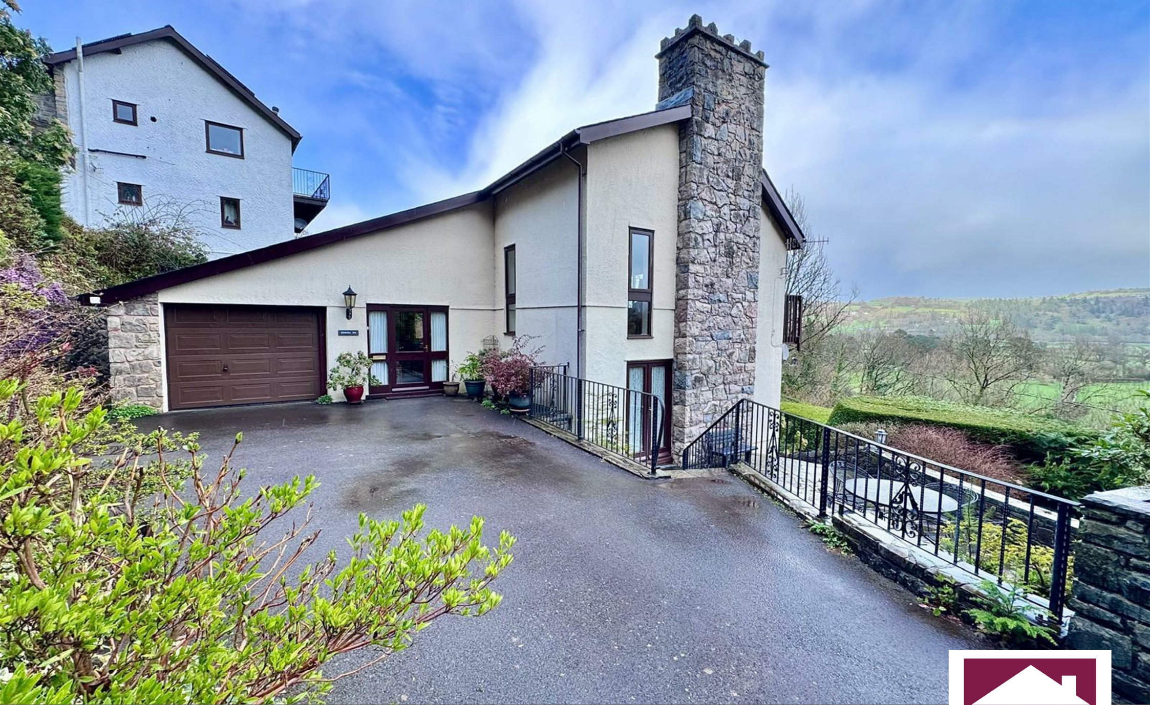
Shimdda Hir Trefriw LL27 0RJ