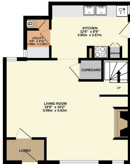
GROUND FLOOR 443 sq.ft. (41.2 sq.m.) approx.