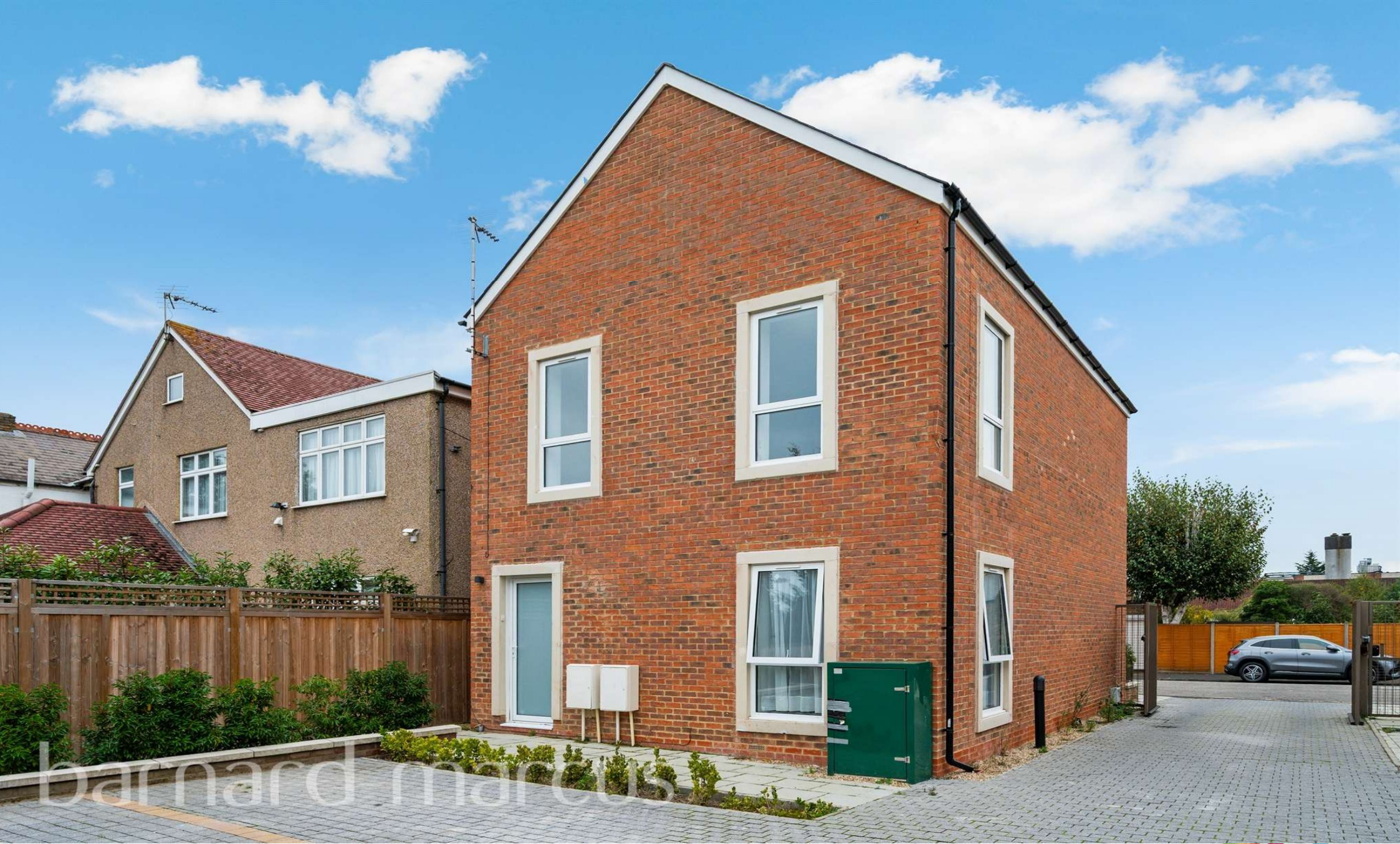
The Annex Cromwell Road, Feltham TW13 5AS