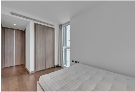
Dahlia House, North Wharf Road, London, W2 1AW