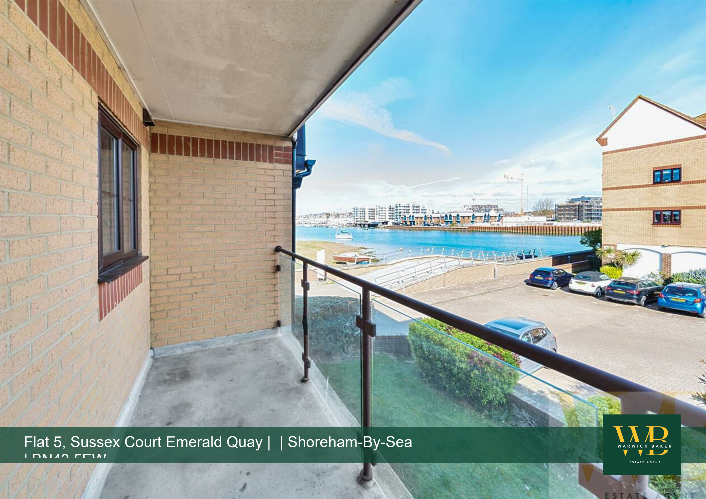
Flat 5, Sussex Court Emerald Quay | | Shoreham-By-Sea