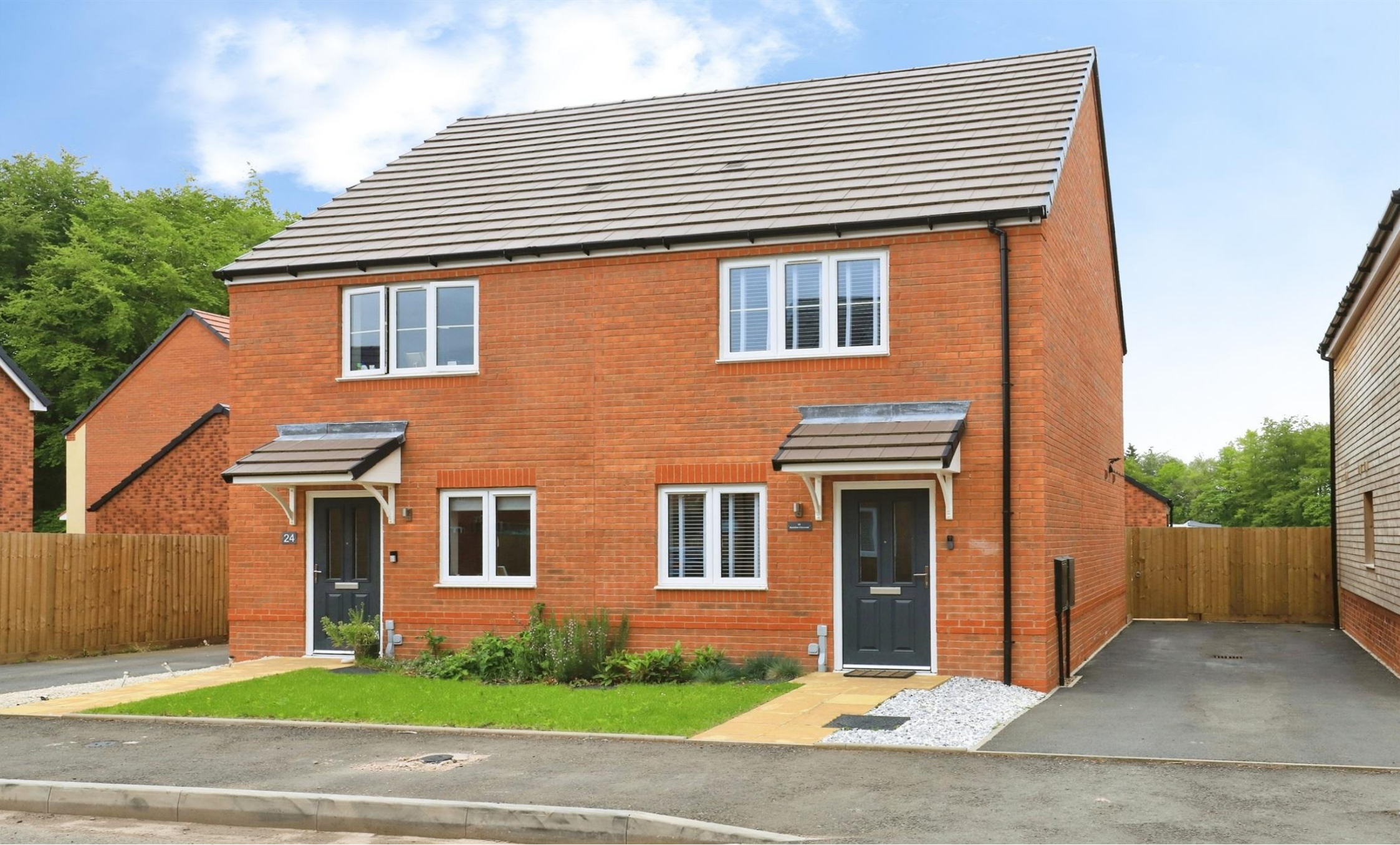
Jasmine Crescent, Lea Castle Kidderminster DY10 3GD