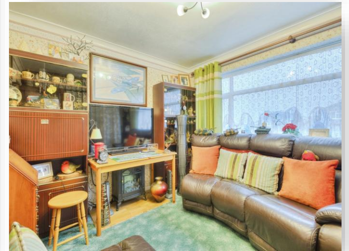
Arkwright Road, Irchester NN29 7HD