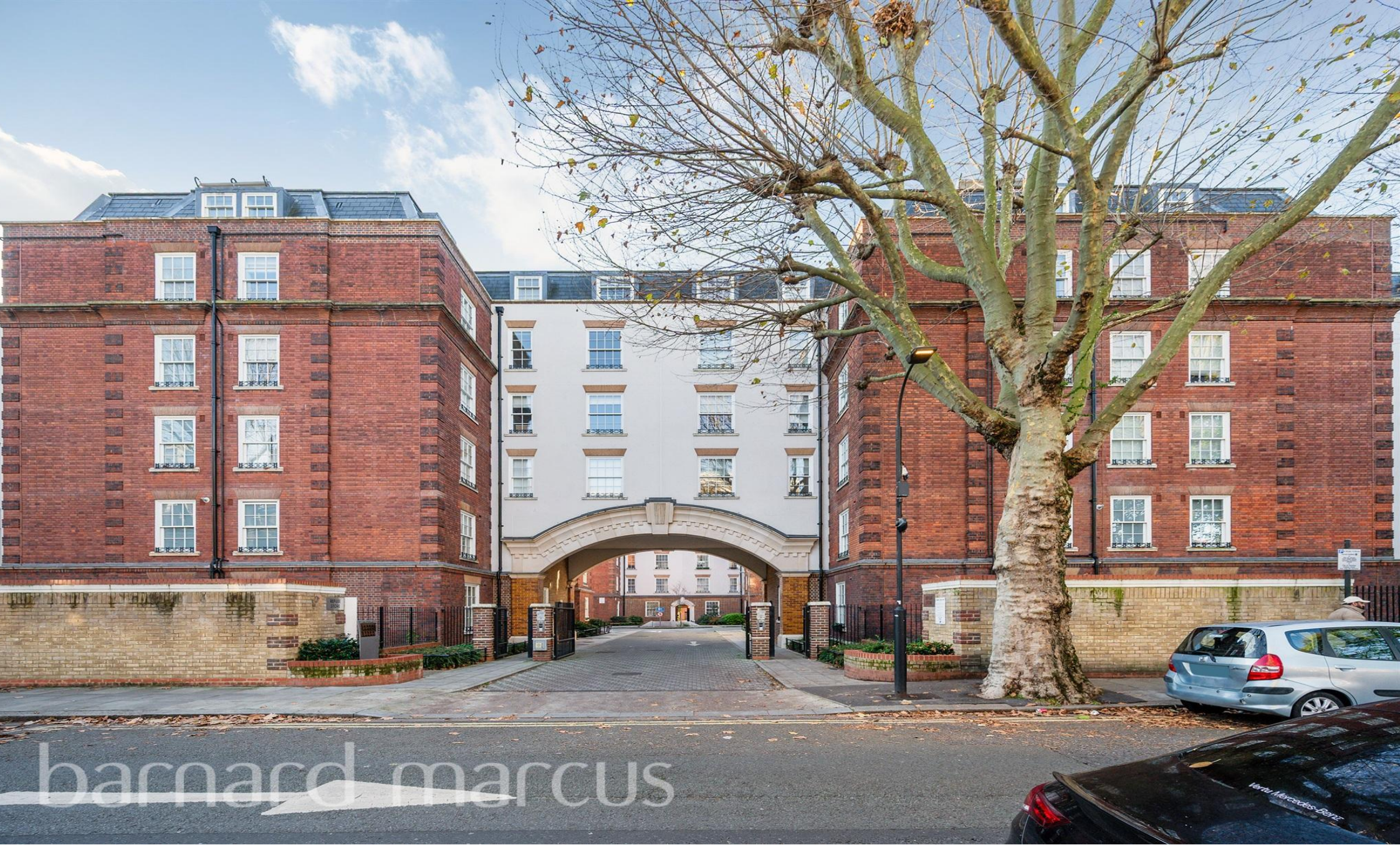
Dorigen Court, Lisgar Terrace, London, W14 8SF