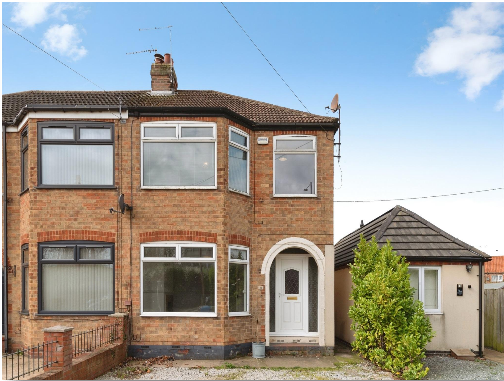
Swinemoor Lane, Beverley, HU17 0LY