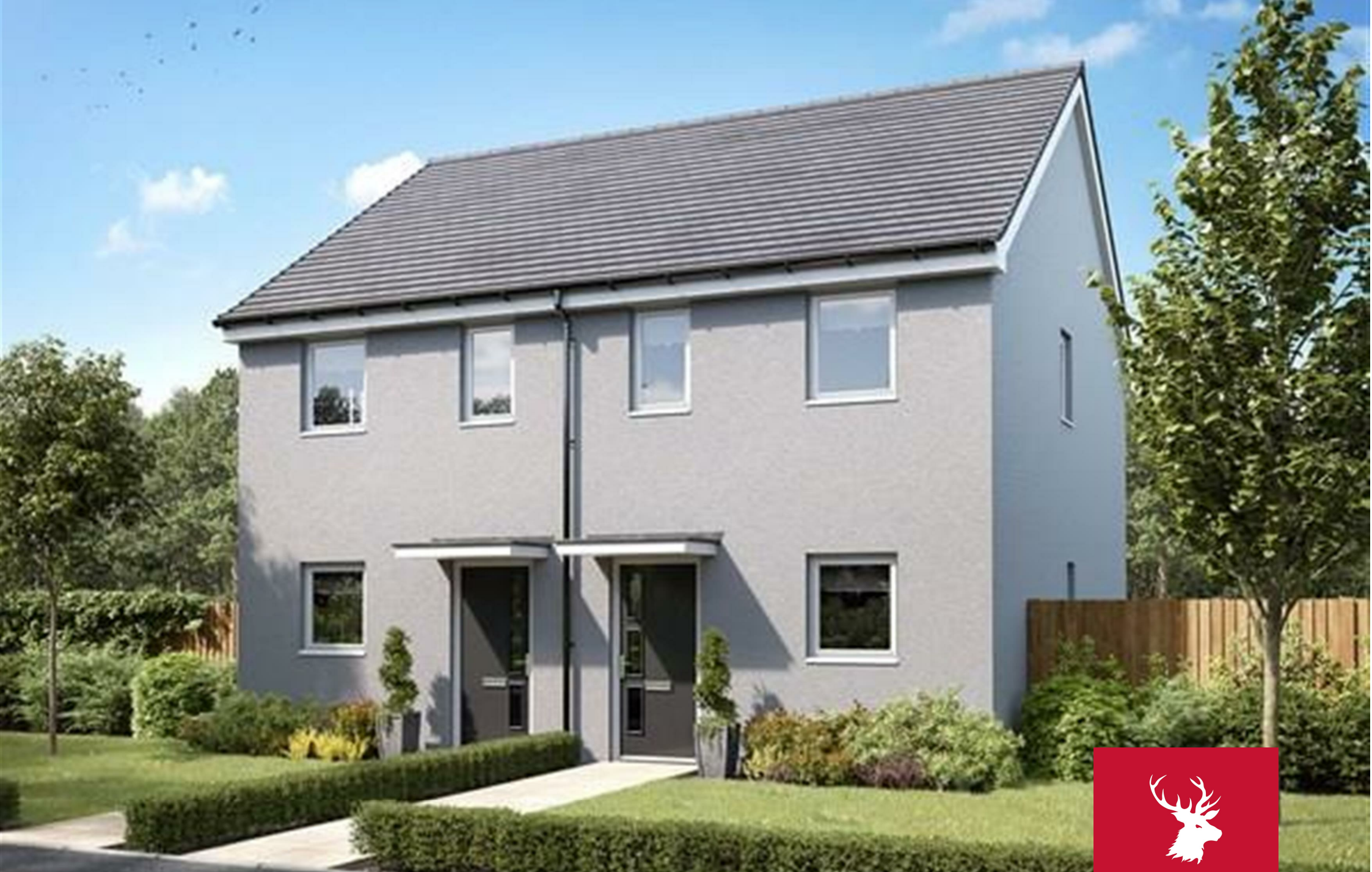
The Alnmouth, plot 62