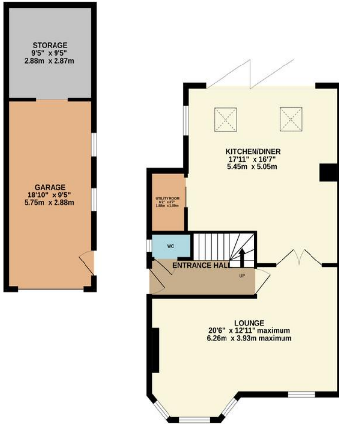
GROUND FLOOR 877 sq.ft. (81.5 sq.m.) approx.