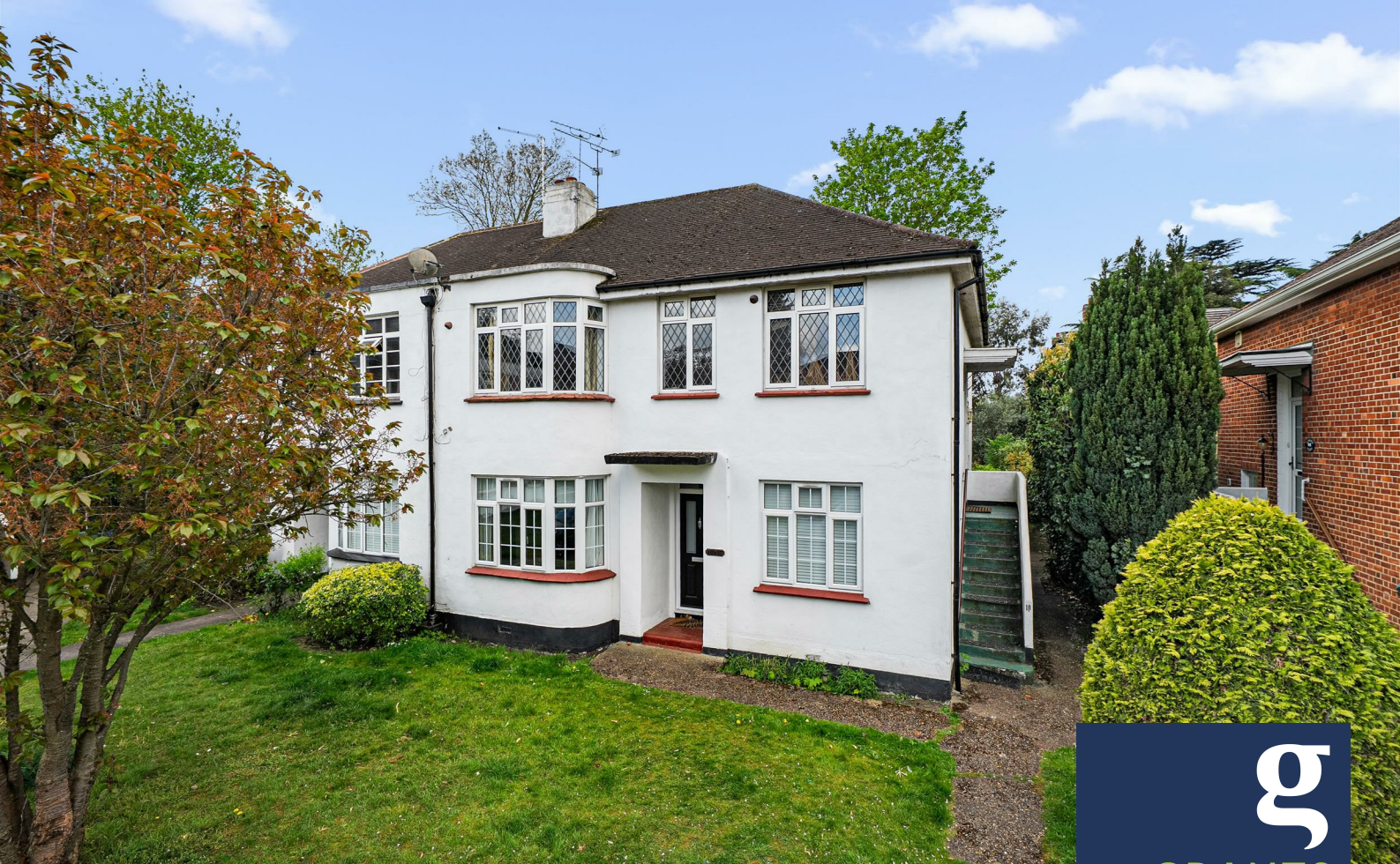
Culverden Court, Oatlands Drive, Weybridge, KT13 9LQ