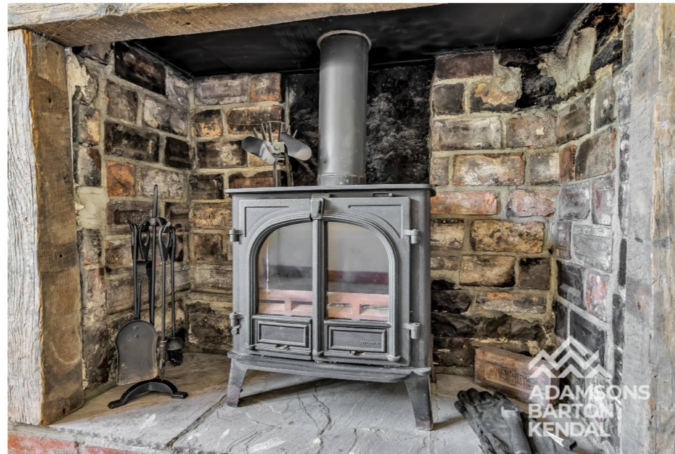
Kiln Gardens, Haugh Square, Rochdale OL16 3RG