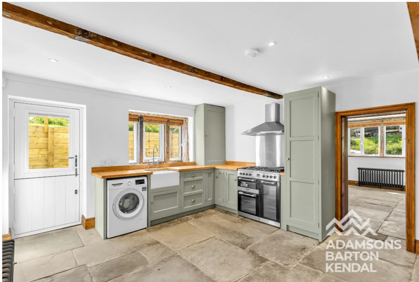
Kiln Gardens, Haugh Square, Rochdale OL16 3RG