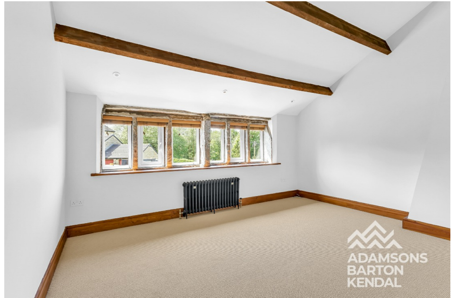
Kiln Gardens, Haugh Square, Rochdale OL16 3RG