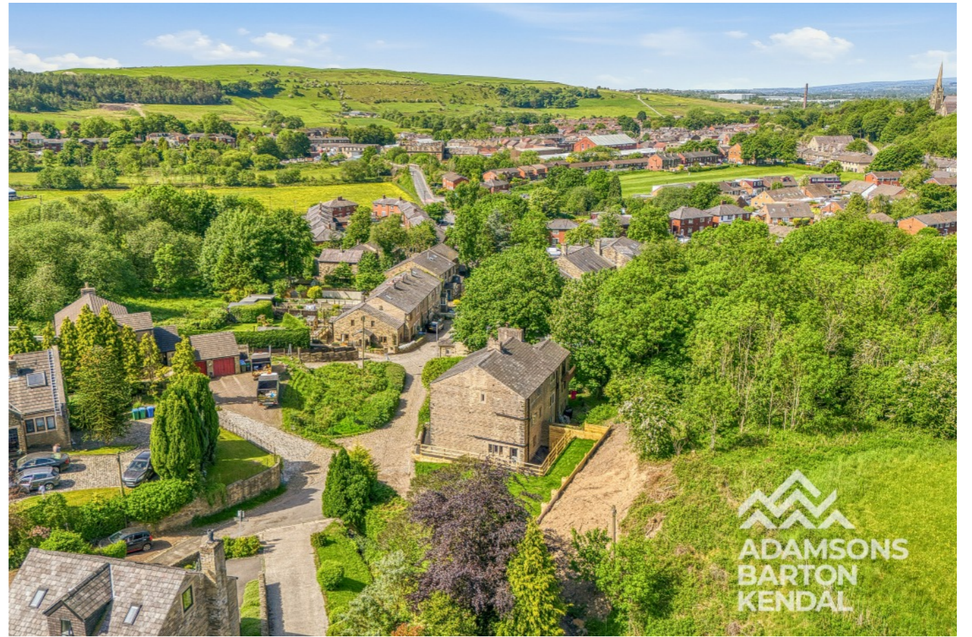
Kiln Gardens, Haugh Square, Rochdale OL16 3RG