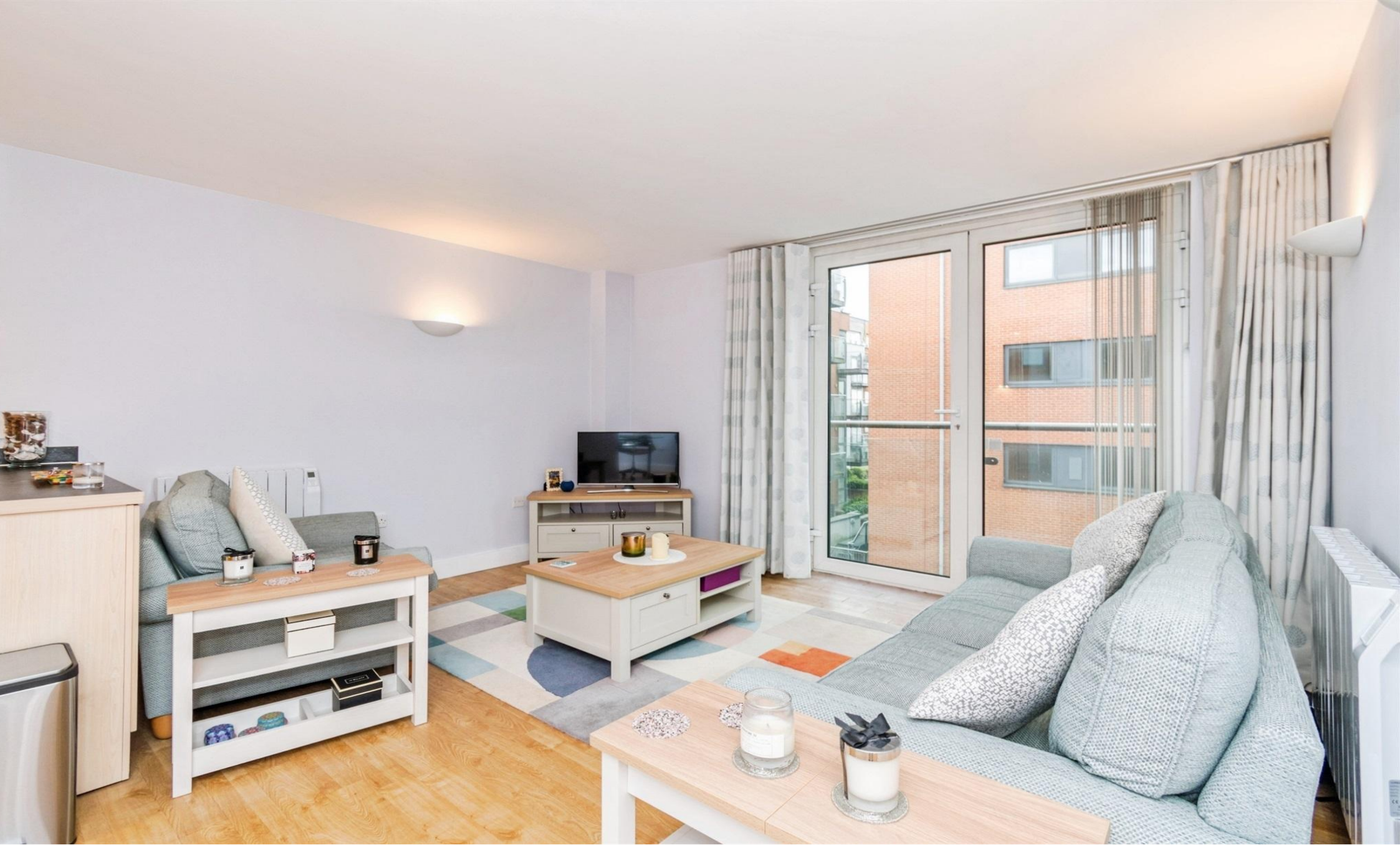
Endeavour Court, Channel Way, Southampton SO14 3GD