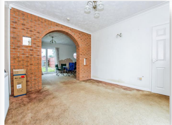
Basin Road, Outwell Wisbech PE14 8TH