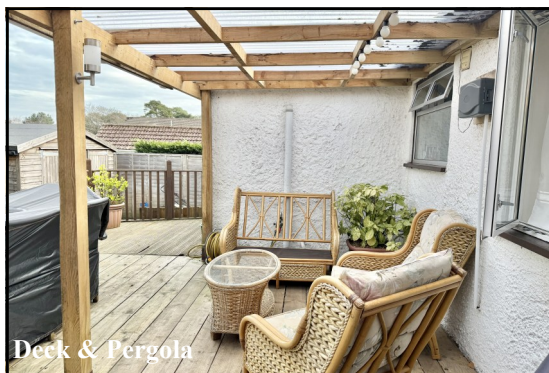
Deck & Pergola