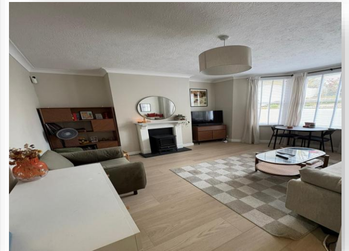
Ditchling Rise, Brighton BN1 4QP