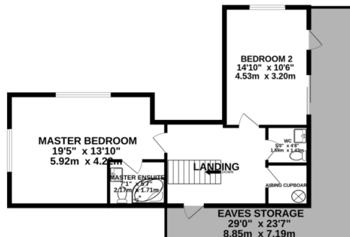
TOTAL FLOOR AREA : 2106 sq.ft. (195.6 sq.m.) approx.

Whilst every attempt has been made to ensure the accuracy of the floorplan contained here, measurements of doors, windows, rooms and any other items are approximate and no responsibility is taken for any error, omission or mis-statement. This plan is for illustrative purposes only and should be used as such by any prospective purchaser. The services, systems and appliances shown have not been tested and no guarantee as to their operability or efficiency can be given. Made with Metropix ©2025