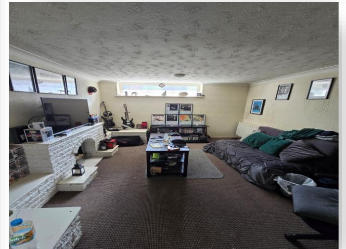
Chestnut Road, Birmingham B13 9AJ