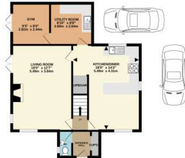
1ST FLOOR 521 sq.ft. (48.4 sq.m.) approx.