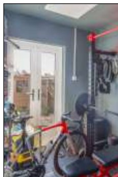
Utility Area and Gym in Garage Conversion