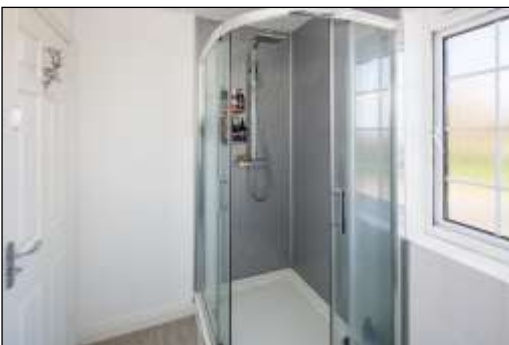
En-Suite to Bedroom One