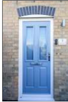
Front Door and Entrance Hall