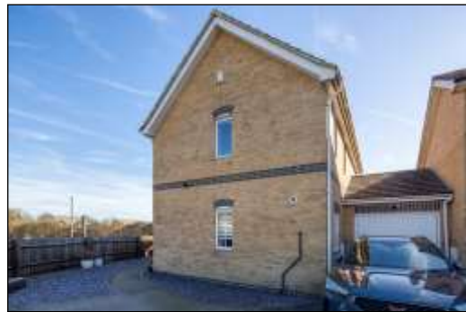
Garage and Parking to Side