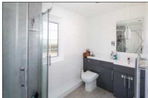
En-Suite to Bedroom One