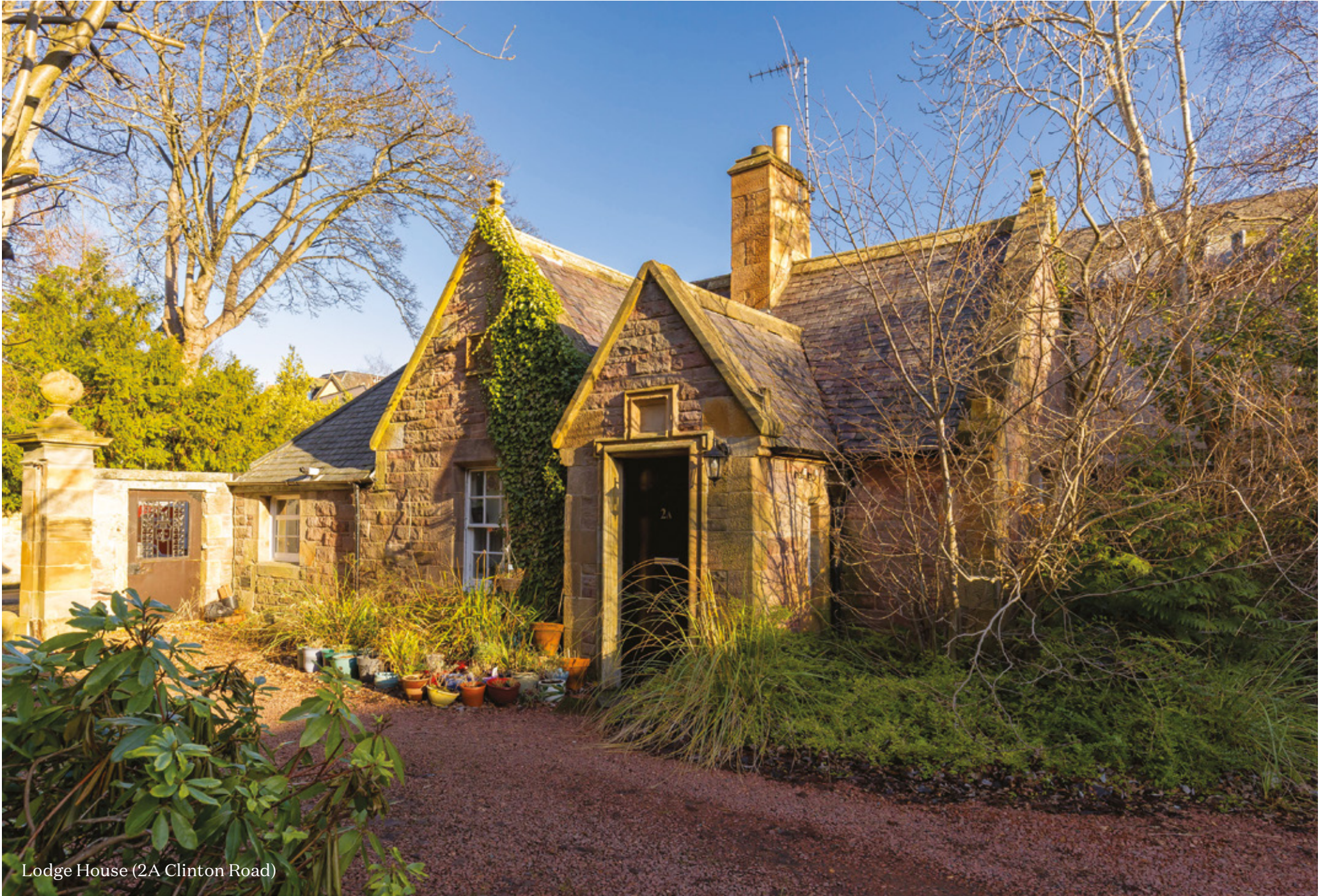
Lodge House (2A Clinton Road)