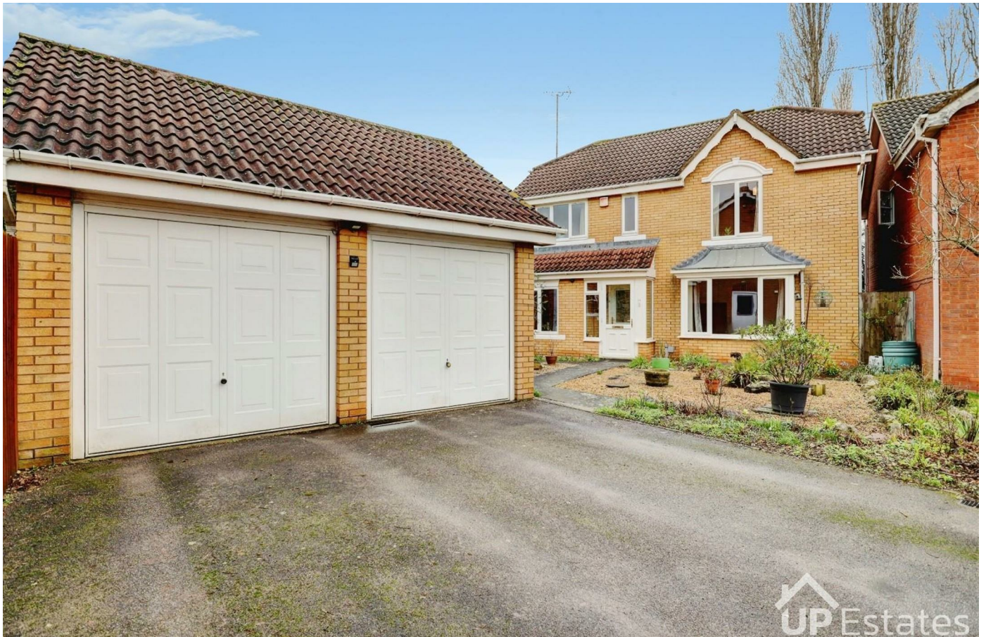
Nolan Close, Longford, Coventry