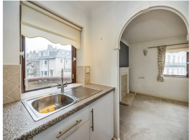
Homeheights Clarence Parade, Southsea PO5 3NN