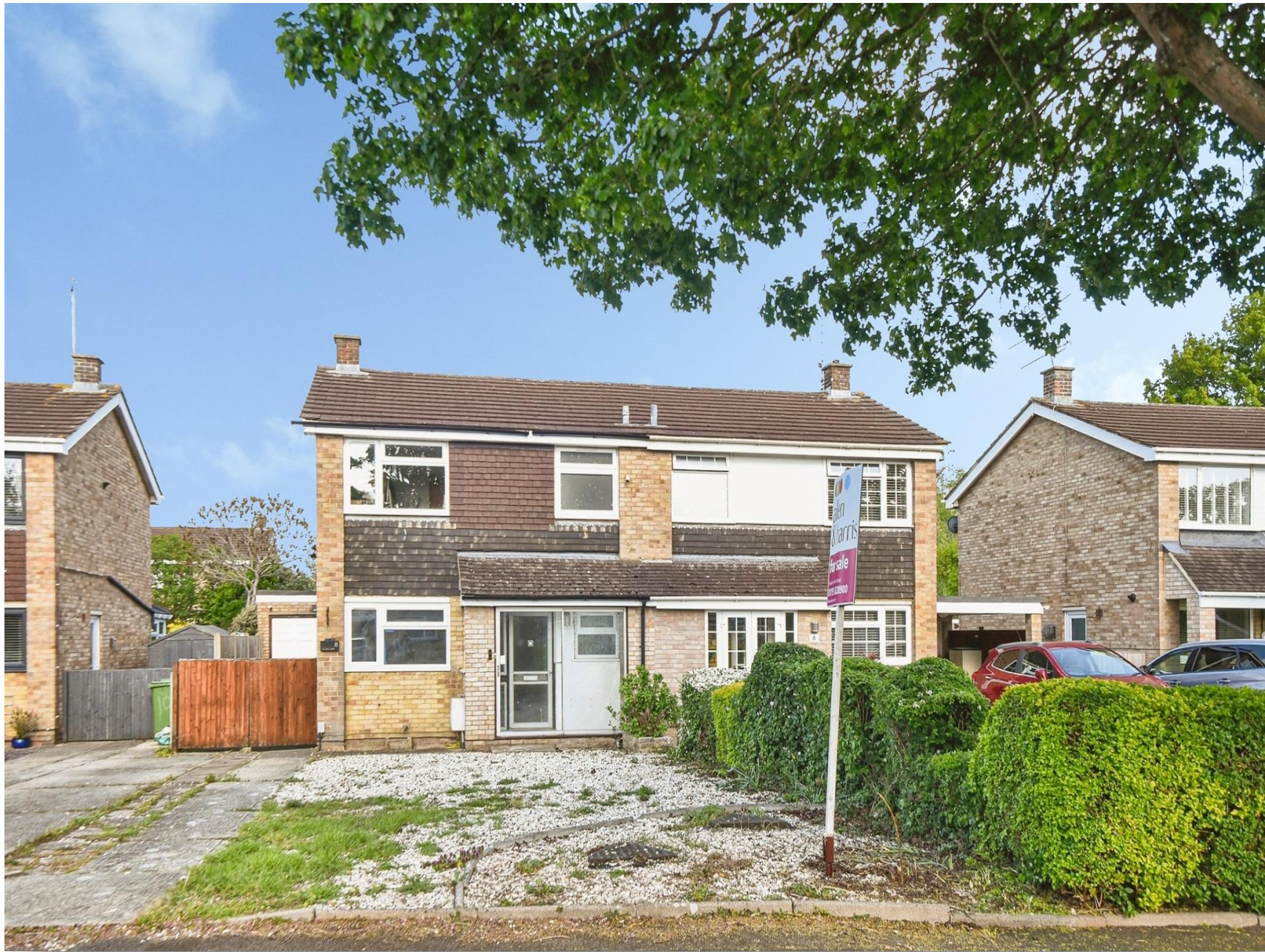
Gilling Way, Swindon, SN3 5EQ