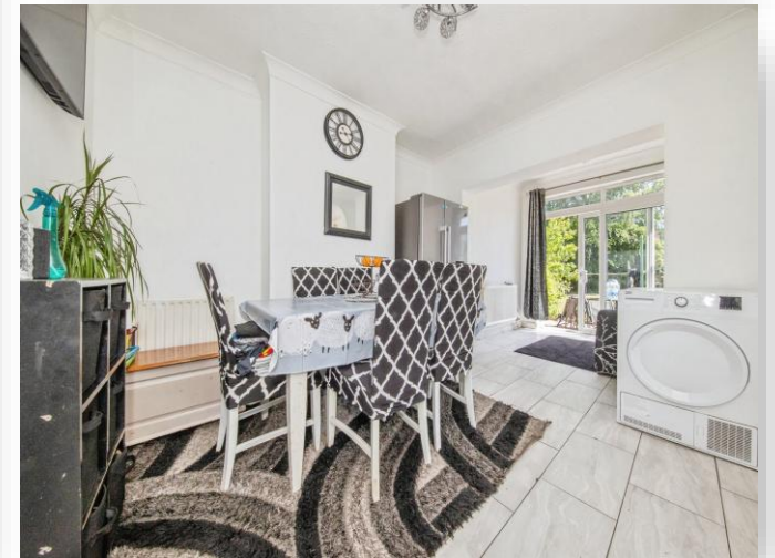
Anita Close East, Ipswich, IP2 0JL