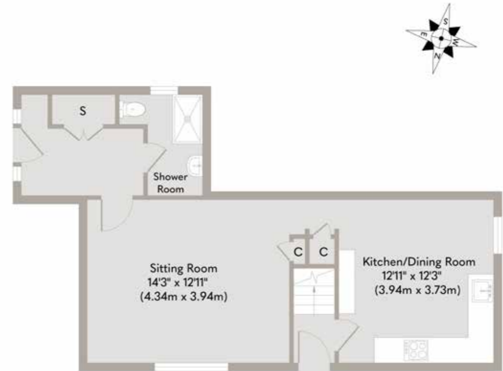
Ground Floor Approximate Floor Area 533 sq. ft (49.54 sq. m)