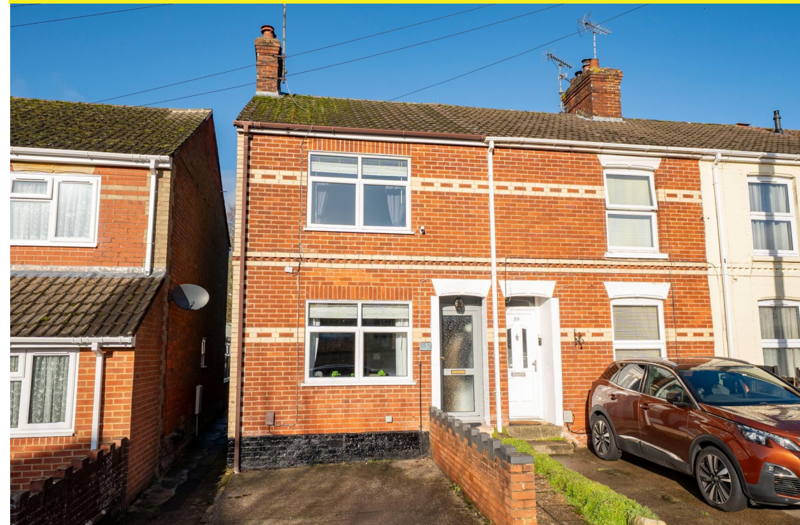
Eastfield Road, Andover