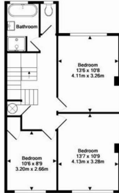
1ST FLOOR APPROX. FLOOR AREA 595 SQ. FT. (55.3 SQ.M.)

TOTAL APPROX. FLOOR AREA 1332 SQ. FT. (123.7 SQ.M.)