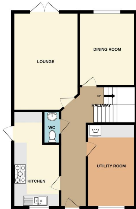
GROUND FLOOR 710 sq.ft. (66.0 sq.m.) approx.