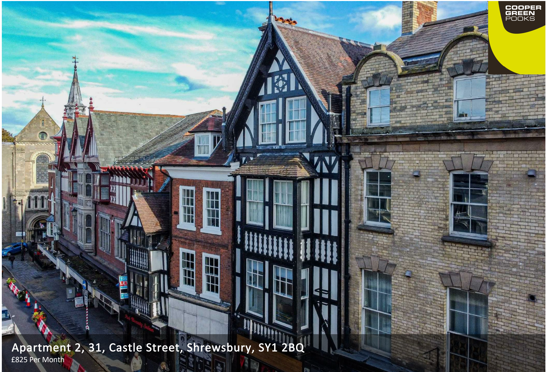
Apartment 2, 31, Castle Street, Shrewsbury, SY1 2BQ £825 Per Month