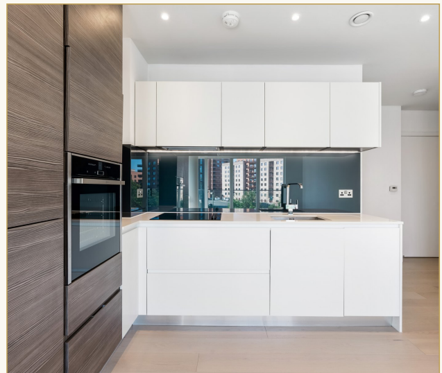
Kitchen with integrated appliances