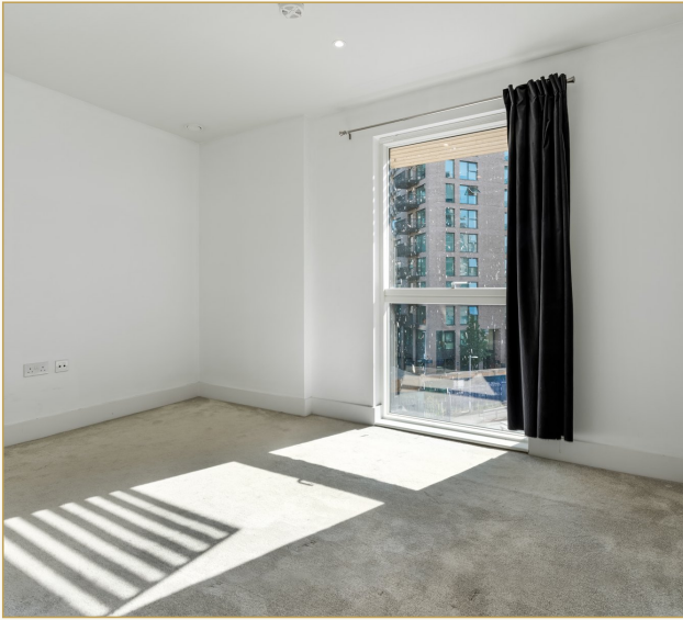
Double bedroom with floor-to-ceiling window

A selection of interior views from across the apartment.