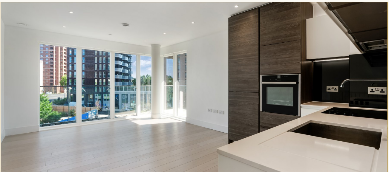
Floor-to-ceiling doors opening onto the private balcony