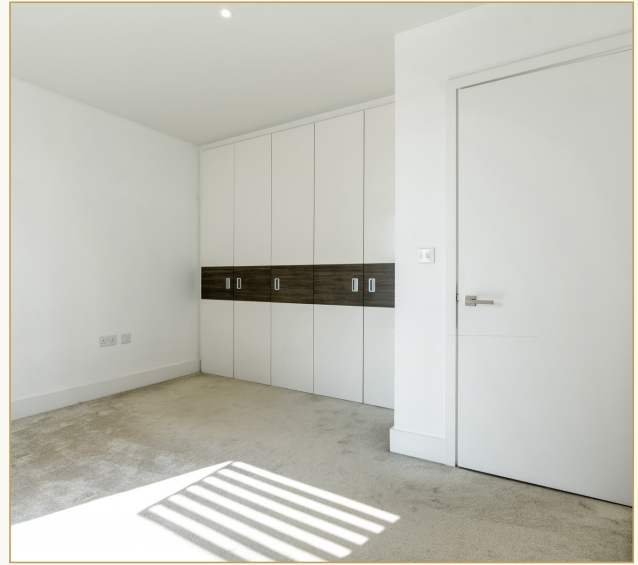
Built-in wardrobe storage