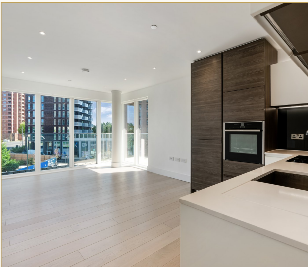
Open-plan living, dining and kitchen

A full range of integrated appliances, sleek handleless cabinetry and stone worktops feature in the kitchen, while engineered wood flooring runs through the living area. The double bedroom benefits from extensive built-in wardrobes, complemented by a contemporary bathroom and a separate utility room.