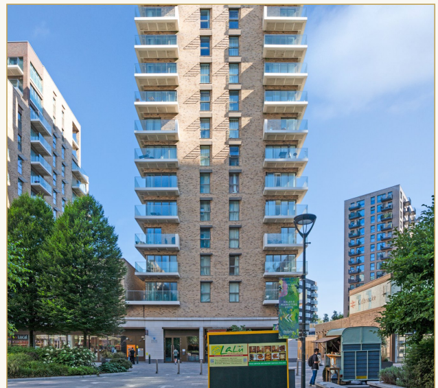
Hopgood Tower, Kidbrooke Village