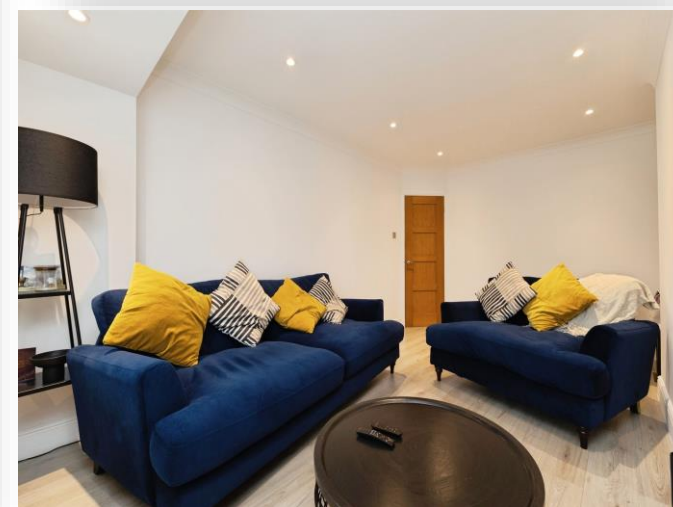
Low Lane, Middlesbrough TS5 8DU