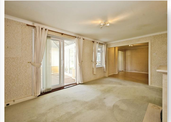
Burroughes Avenue, Yeovil, BA21 3JT