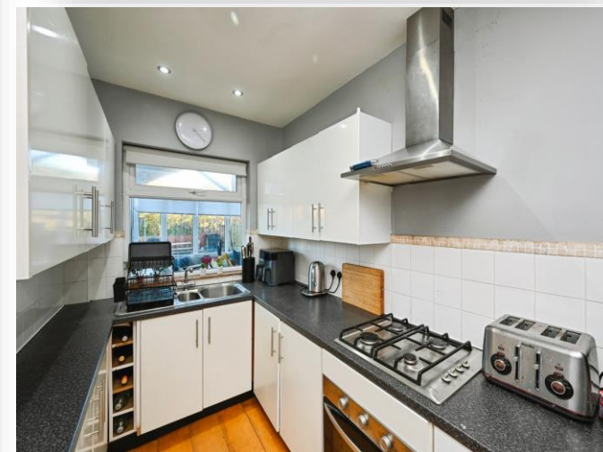
Thomas Avenue, Radcliffe-On-Trent Nottingham NG12 2HT