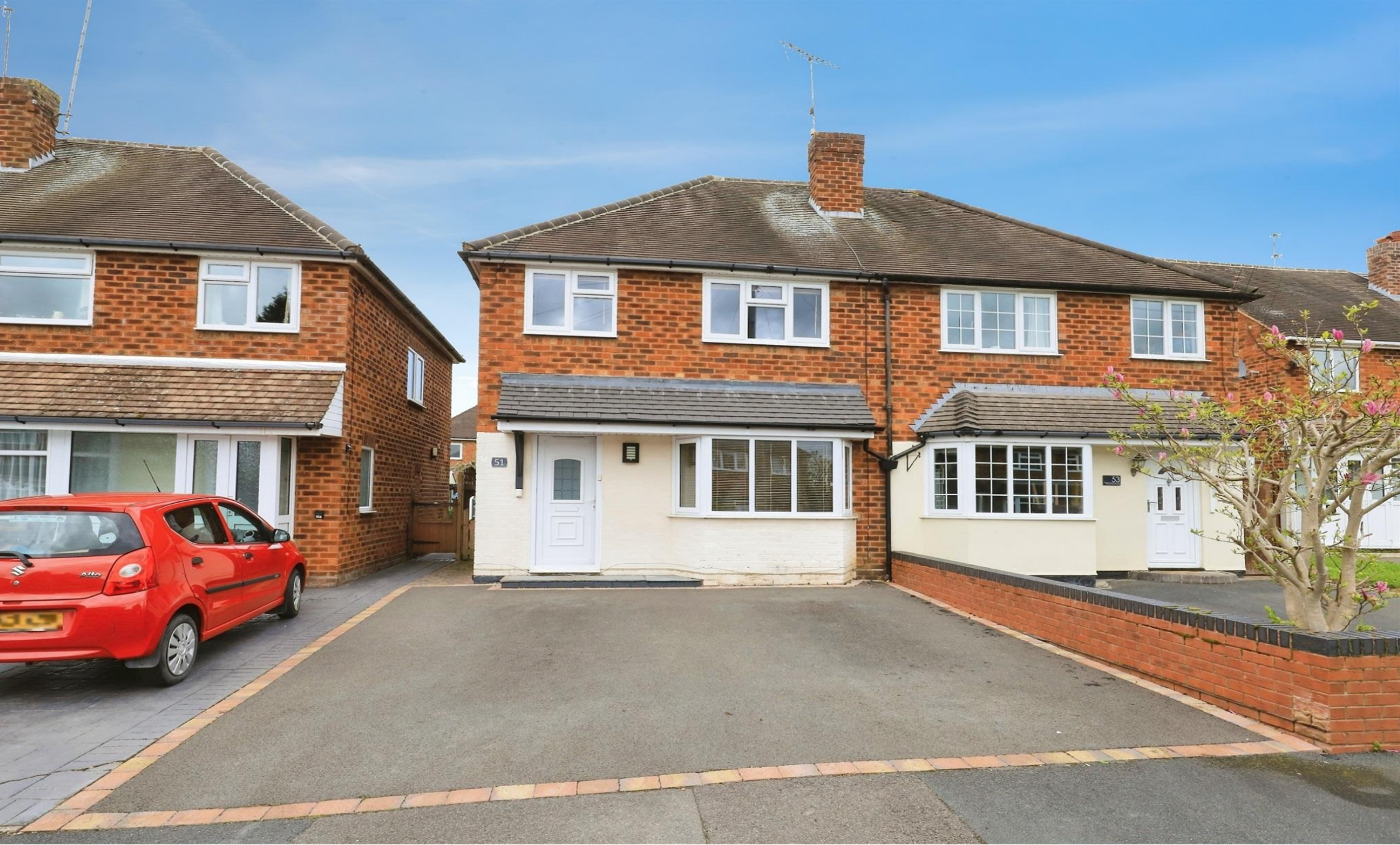
Rosemary Road, Kidderminster DY10 2SW