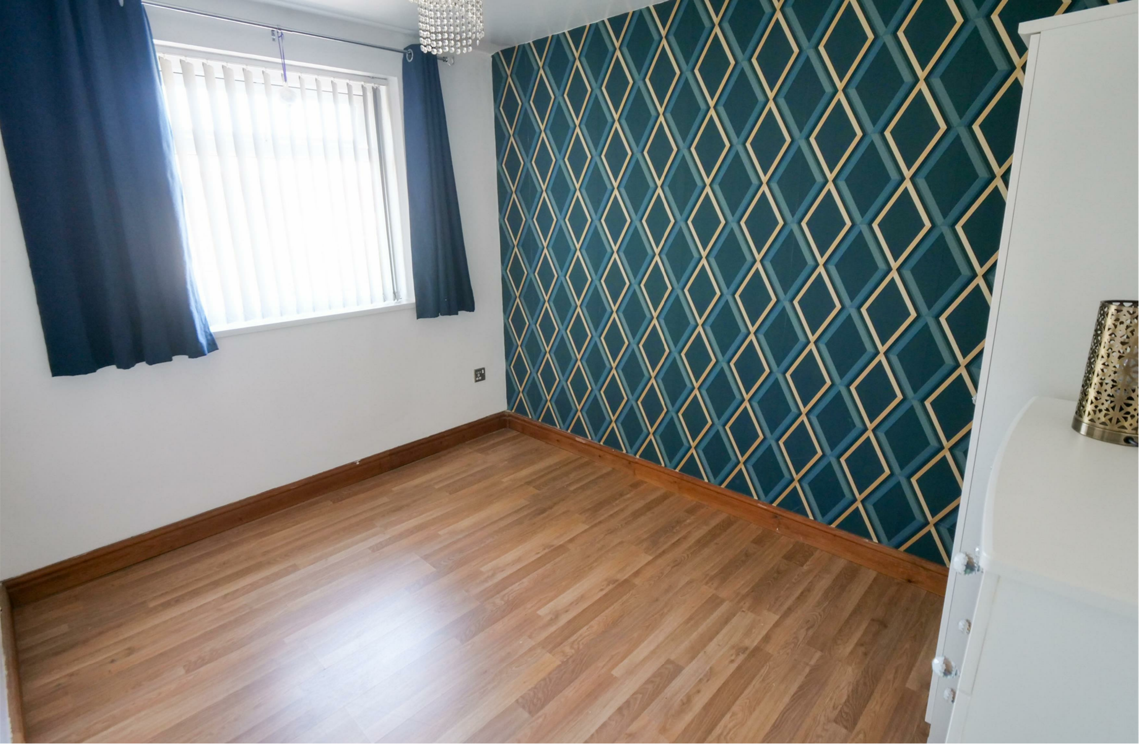
Thomas Grove, Morecambe, LA4 5TF