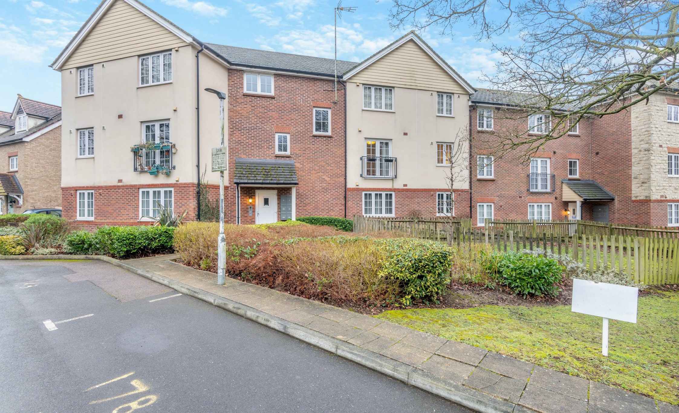
Mauritius House, Balliol Grove, Maidstone, Kent, ME15 9WQ Price £175,000