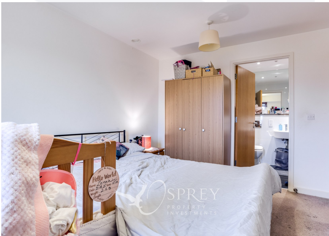
Mulberry House, Wakefield, WF1 2SE