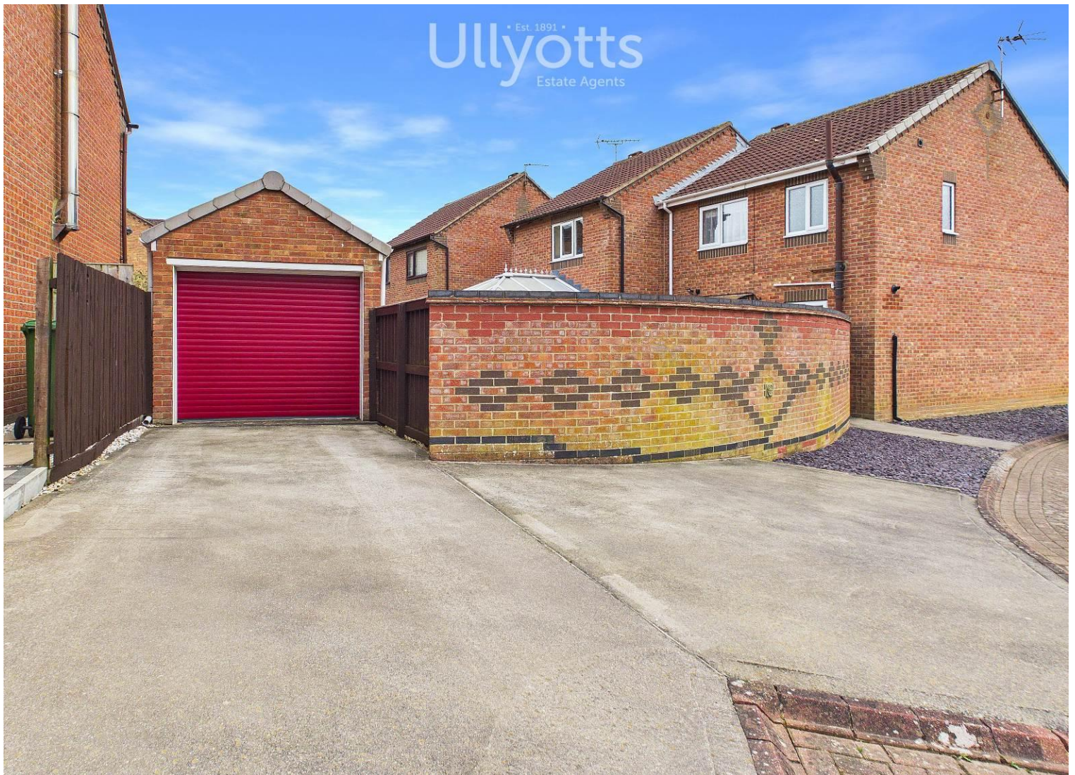
Garage and off-road parking