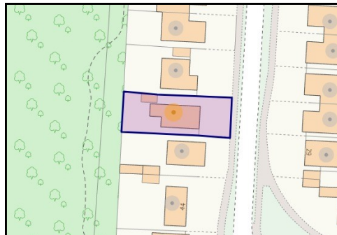
Plot Plan for identification purposes only

This drawing has been prepared for diagrammatic purposes only. All measurements are approximate. Not to scale.